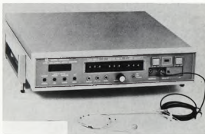
Fig. 4 Cardiac Output Computer

Swan-Ganz flow directed, Right Heart Catheter in situ showing balloon inflated for Pulmonary-Capillary wedge pressure reading to be taken. RA- Right Atrium, RV- Right Ventricle, PA- Pulmonary Artery, PCW- Pulmonary-Capillary wedge.