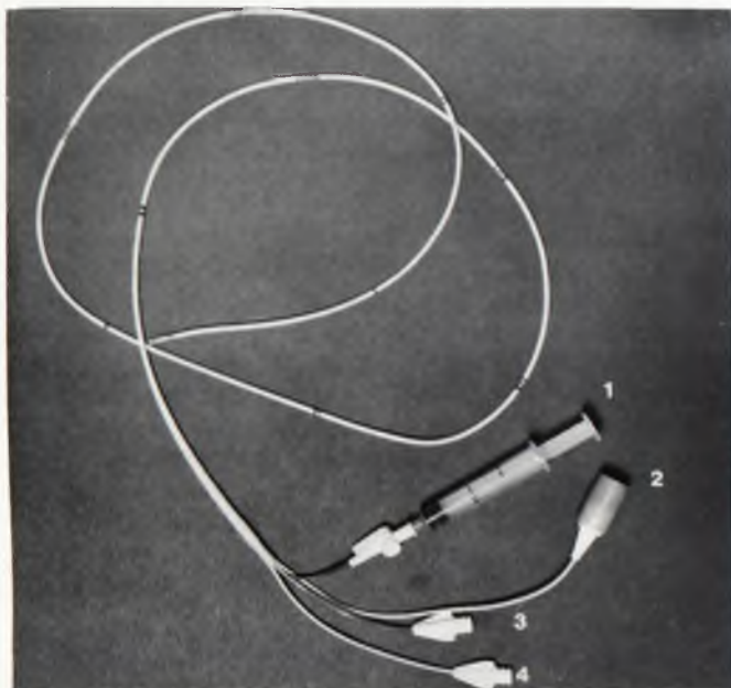
Fig. 1 SWAN-GANZ THERMODILUTION CATHETER WITH QUADRUPLE LUMEN